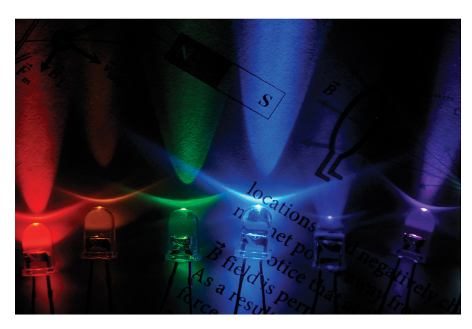
Fig. 2. A rainbow of LEDs: red, yellow, green, blue, ultraviolet, pink, and white.

Here, we provide an overview and some questions that teachers or students might pose or should be encouraged to pose about the experiments. In most cases the questions come after the experiment; blue arrows [ ] in the tables indicate the cases when the question comes before the experi-